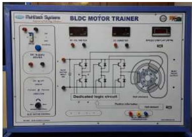
BLDC MOTOR TRAINER