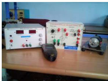
MOSFET BASED CHOPPER