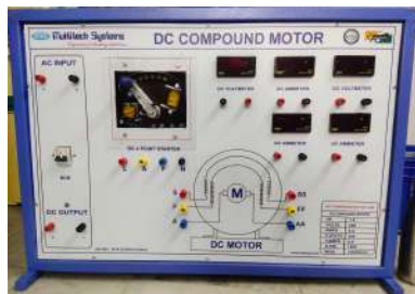
DC COMPOUND MOTOR