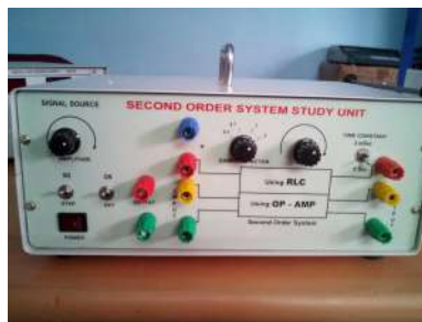
TIME RESPONSE SECOND ORDER SYSTEM STUDY