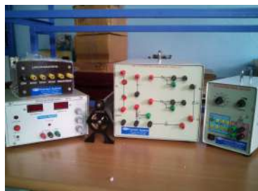
JOHNES CHOPPER POWER CIRCUIT