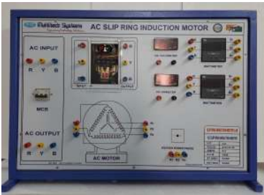
AC SLIP RING MOTOR