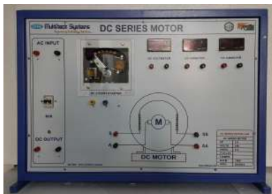
DC SERIES MOTOR