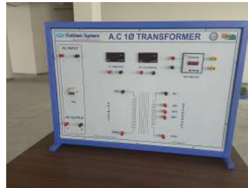
AC 1 PH TRANSFORMER