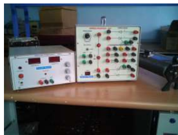
SINGLE PHASE SERIES INVERTER