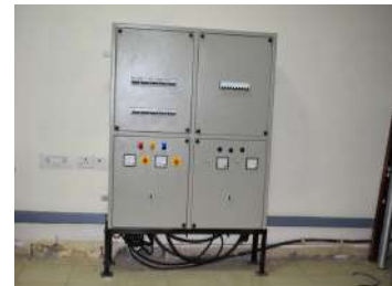
DISTRIBUTED CONTROL PANEL