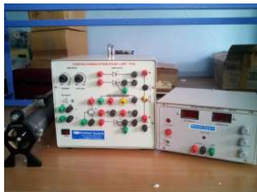
FORCED COMMUTATION STUDY UNIT