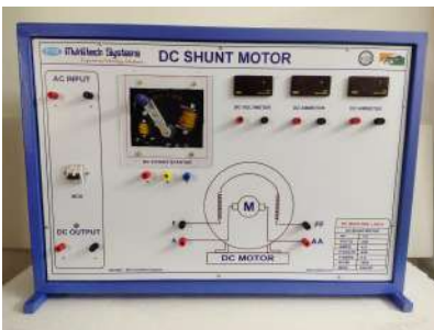
DC SHUNT MOTOR