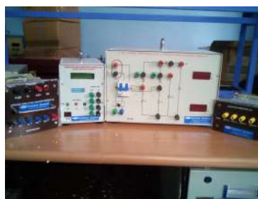
SINGLE PHASE HALF CONTROLLED CONVERTER