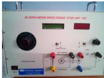
AC SERVO MOTOR CHARACTERISTIC STUDY