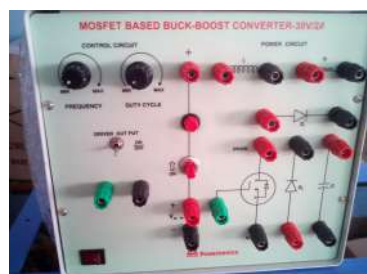
BUCK BOOST CONVERTER