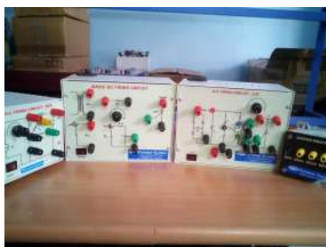
GATE FIRING CIRCUIT FOR SCR